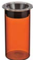
HARIO COLORS Canister HCN-400-AB

C/T24 414587 W80 x D80 x H143mm \Phi 70mm Full capacity: 400mL Material: Main body/lid/heatproof glass Lid packing/silicone rubber