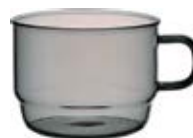
HARIO COLORS Stack Mug HCM-300-GR

C/T24 219953 W117 x D90 x H70mm \Phi 90mm Full capacity: 300mL Material: Main body/heatproof glass