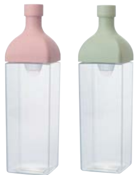
Ka-Ku Bottle KAB-120-SPR

C/T24 037571 W90 x D90 x H320mm Φ85mm Practical capacity 1,200mL Material: Bottle packing, Cap packing / Silicone rubber Removable bottle top, Filter, Mesh / Polypropylene Bottle / PCT resin