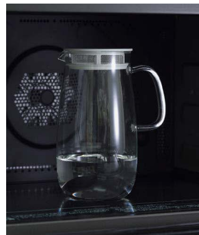
Compatible with microwave ovens with an internal height of 19cm or more.