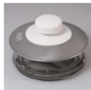
Lid to prevent spills.

An electric brewer that allows you to safely simmer your infections; Equipped with 7 levels of heat and a timer that can be set in 10 minutes increments from 10 to 70 minutes. Features a lid that prevents spills.