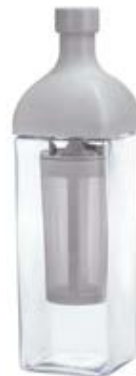
Ka-Ku Coffee Bottle KAC-110-PGR

C/T24 730199 W90 x D90 x H320mm Φ85mm Finished Capacity 1,000mL 8 cups Material: Body/PCT resin Removable bottle top, Strainer/Polypropylene Filter, Mesh/Polyester Packing / Silicone rubber