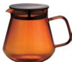
HARIO COLORS Tea & Coffee Server HCT-600-AB

C/T24 140868 W150 x D118 x H125mm \Phi 80mm Full capacity: 600mL Material: Main body/heatproof glass Lid/filter/polypropylene Lid packing/silicone rubber