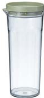
Freezer Pot JUSIO (樹脂王) FPJ-11-SG

C/T24 232075 W110 x D100 x H245mm Φ100mm Practical capacity 1,000mL Material: Lid / Polypropylene Body / PCT resin Packing / Silicone rubber