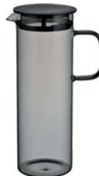
HARIO COLORS Cold Brew Pitcher HCB-800-GR

C/T24 414693 W136 x D87 x H235mm \Phi 80mm Practical capacity 800mL Material: Main body/heatproof glass Lid/filter/polypropylene Lid packing/silicone rubber