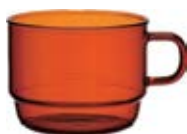
HARIO COLORS Stack Mug HCM-300-AB

C/T24 219953 W117 x D90 x H70mm \Phi 90mm Full capacity: 300mL Material: Main body/heatproof glass