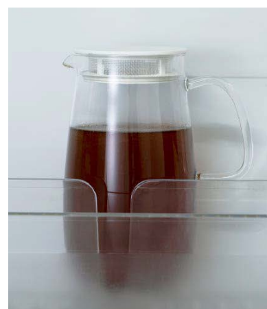
Can be stored in a refrigerator door pocket with a depth of 11cm or more.