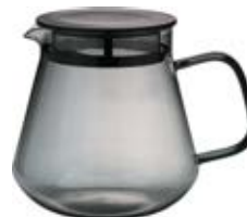
HARIO COLORS Tea & Coffee Server HCT-600-GR

C/T24 140868 W150 x D118 x H125mm \Phi 80mm Full capacity: 600mL Material: Main body/heatproof glass Lid/filter/polypropylene Lid packing/silicone rubber