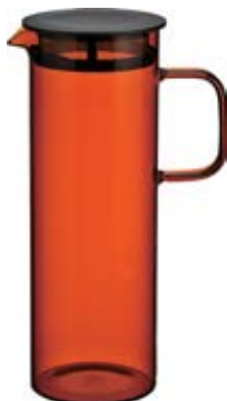
HARIO COLORS Cold Brew Pitcher HCB-800-AB

C/T24 414693 W136 x D87 x H235mm \Phi 80mm Practical capacity 800mL Material: Main body/heatproof glass Lid/filter/polypropylene Lid packing/silicone rubber