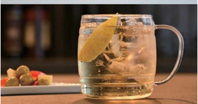
HOW TO (make alcohol at a ratio of 1:3)