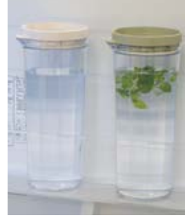
You can also store it horizontally. It is also sized to fit in the refrigerator door pocket.