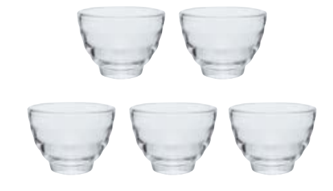
Heatproof Glass Yunomi 5pcs Set HU-3012

C/T12 836631 W86 x D86 x H63mm Ф86mm Full capacity 170mL