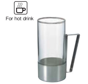
Hot Glass "Square" HW-8SSV

C/T24 418332 W90 x D60 x H120mm Φ55mm Full capacity 220mL